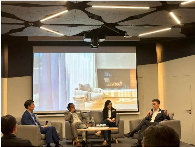
MSVC Fireside Chat at NUS