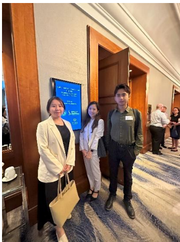
CIIE Promotion Event