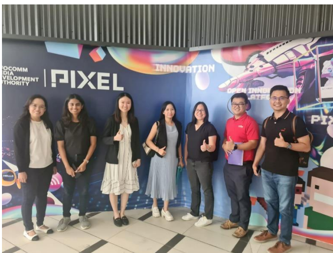
Corporate Visit to PIXEL IMDA