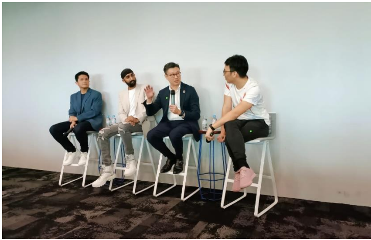
SG Scape Event