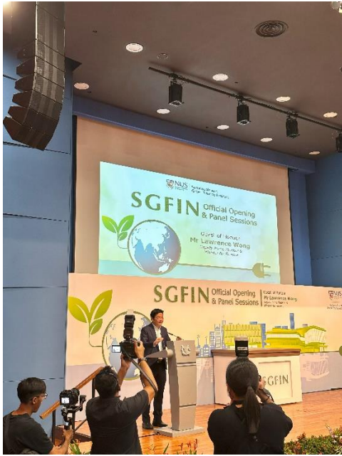
NUS SGFin Launch graced by Deputy Prime Minister in Singapore – Mr. Lawrence Wong.